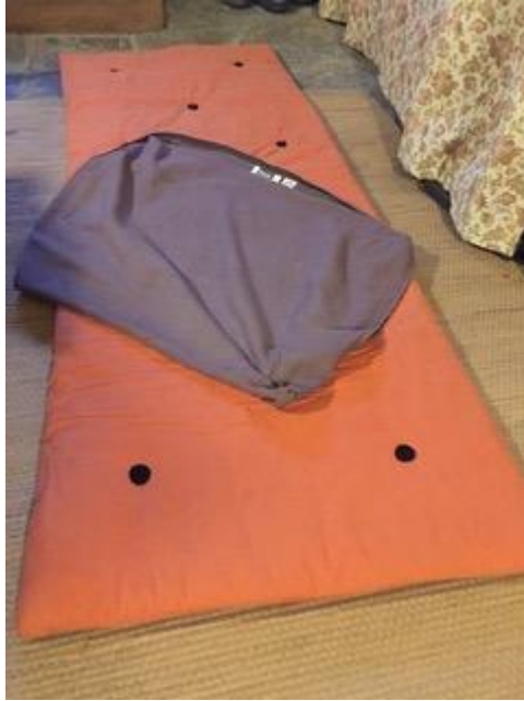
Lot 42 "Futon" mattress which packs away into a cover to form a cushion - useful for youngsters.