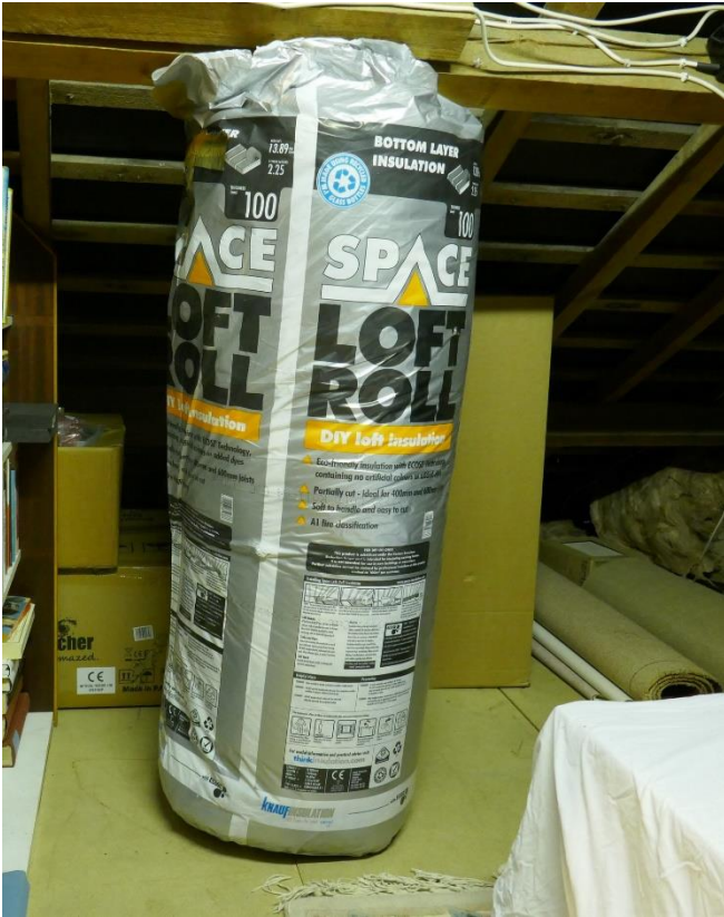
Lot 30 Wrap up for the winter with an unopened roll of glass fibre insulation