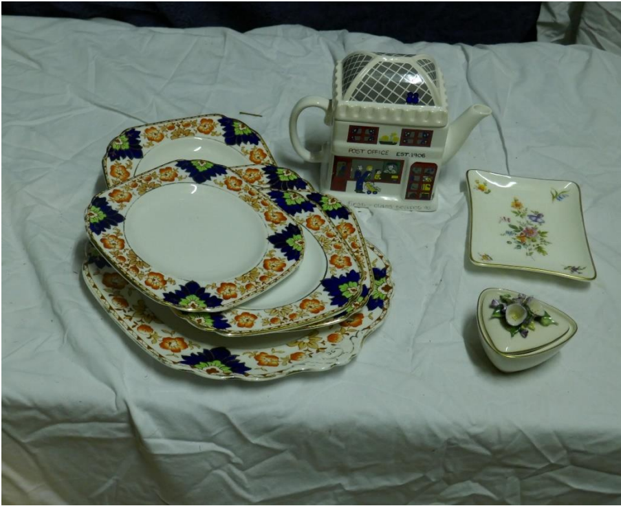
Lot 16 Nice plates, rural Post Office tea pot (to bring back memories of Rupert and Joan?) and knick-knack / nick-nack containers