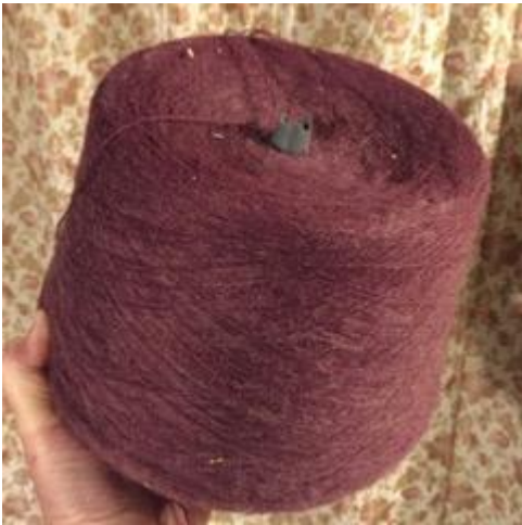
Lot 43 Large spool of knitting yarn