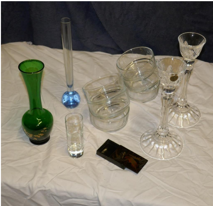
Lot 6.1 Green glass vase and bubble blue vase AND nice cut glass "posies" pot