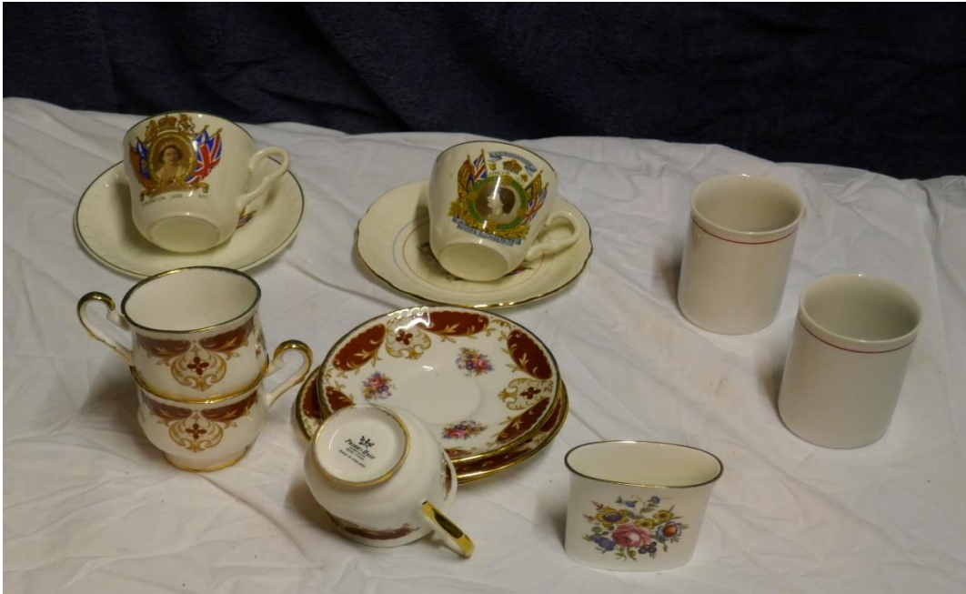
Lot 5.1 Nice English bone china cups of tea for three