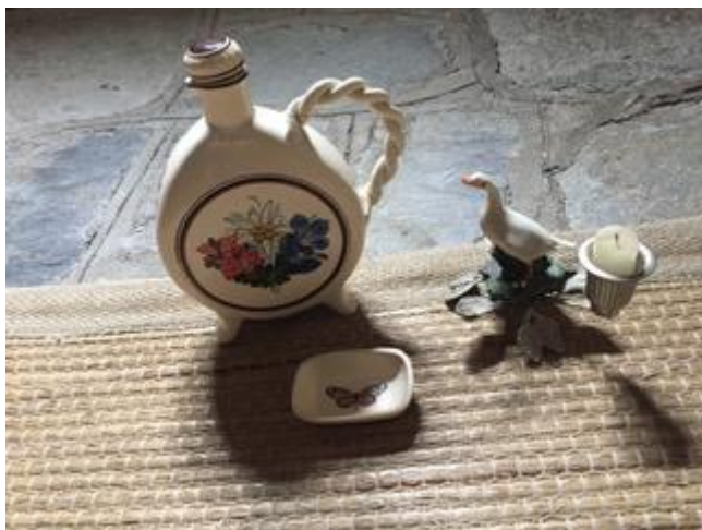
Lot 41 Assorted ornaments