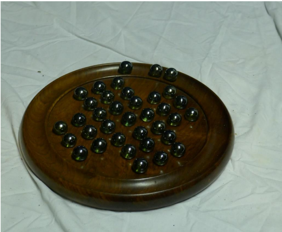
Lot 19 Solid wood base and glass ball Solitaire Set

A nice way to spend the time off the phone