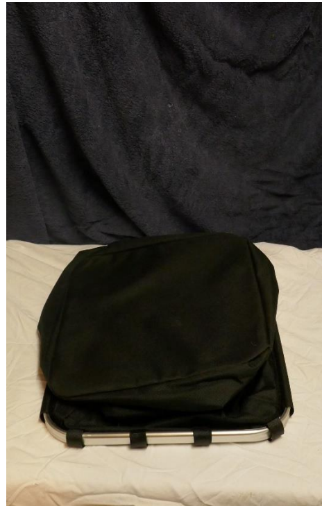
Lot 3 Collapsible camping clothes basket or maybe for the garden?