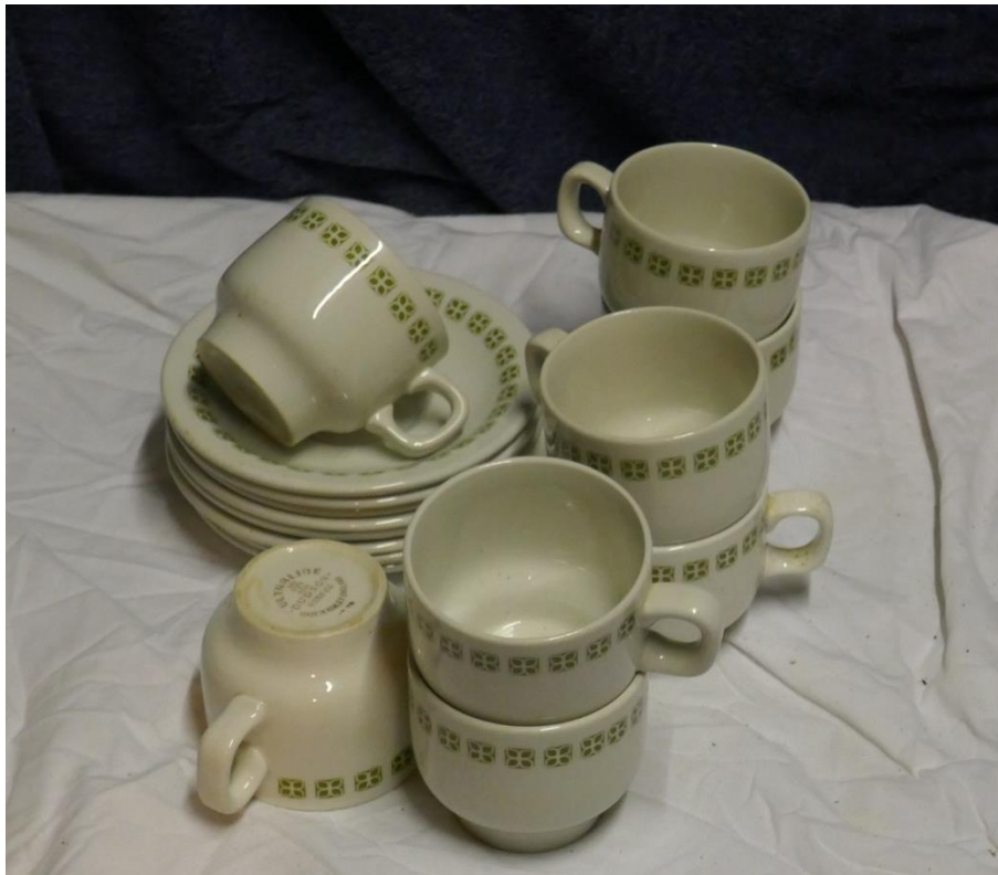
Lucky for some! Lot 13 A stern and business like set of six cups and saucers