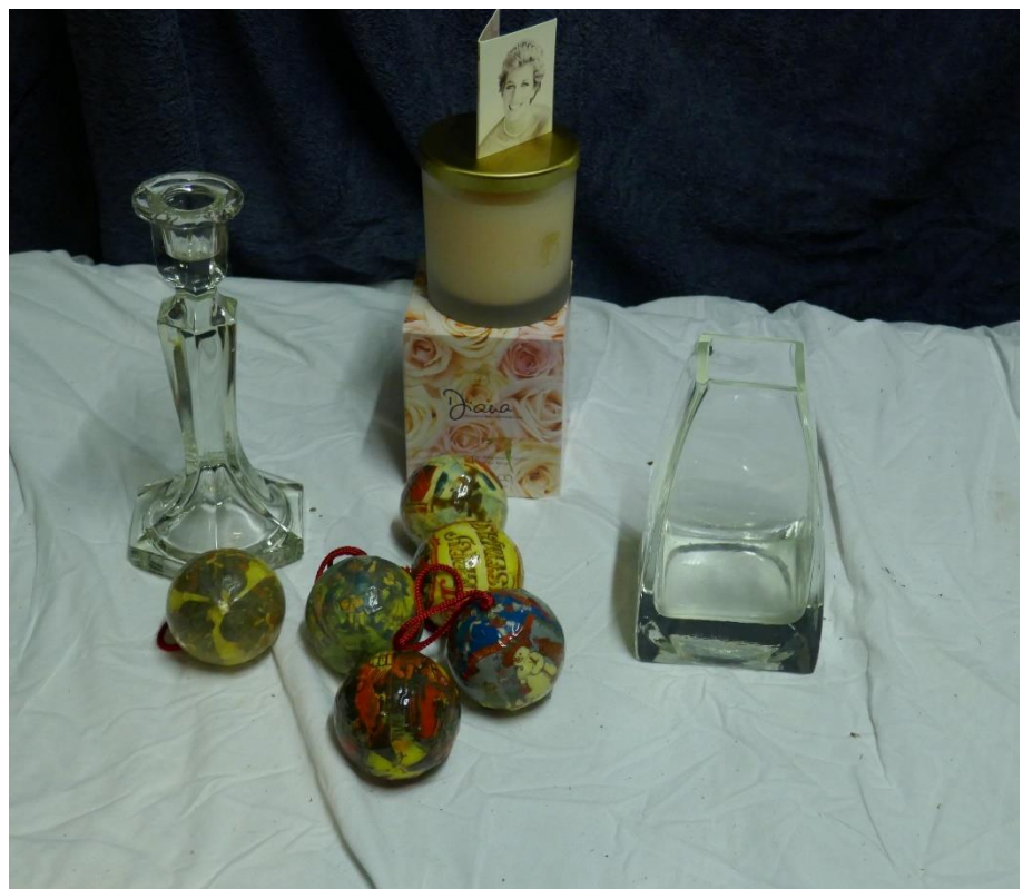
Lot 18.1 Victoriana Xmas Baubles