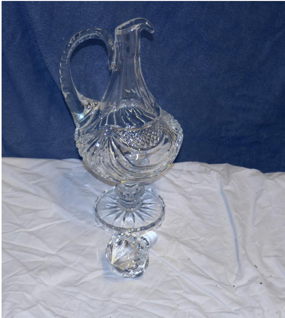
Lot 14 This is heavy because it's lead glass, it is classy with its cut glass pattern, tall at 40 cm high (that's 16 inches in old money) and sparkly! We are looking for a bid price to match – there is a reserve on it. We are big hearted so money back if not satisfied