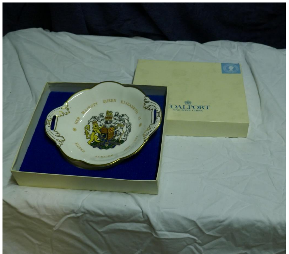
Lot 20 Genuine Coalport China thingy for the Silver Jubilee

A nice way to spend the time off the phone