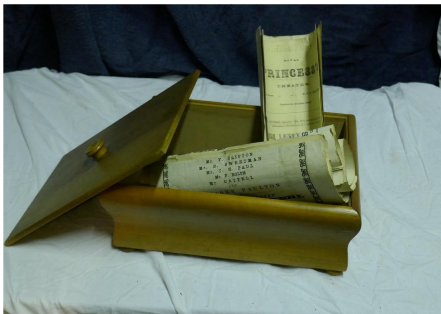
A mystery box found in the attic

Lot 27 Contains numerous theatre programmes from 1875 to 1890 - Adelphi, Princess Theatre, etc. full of fascinating historical touches' especially for thespians