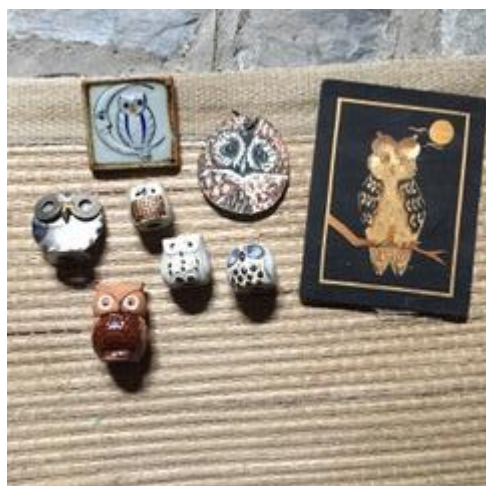
Lot 41 A lot of owls.