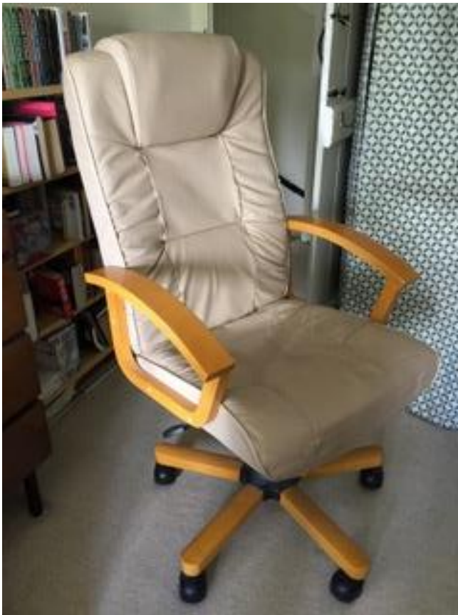
This is a Cracker! We have just spent £80 on a crummy plastic and steel seat and along this comes – might be a hefty bid from this office! Don't let me get it!