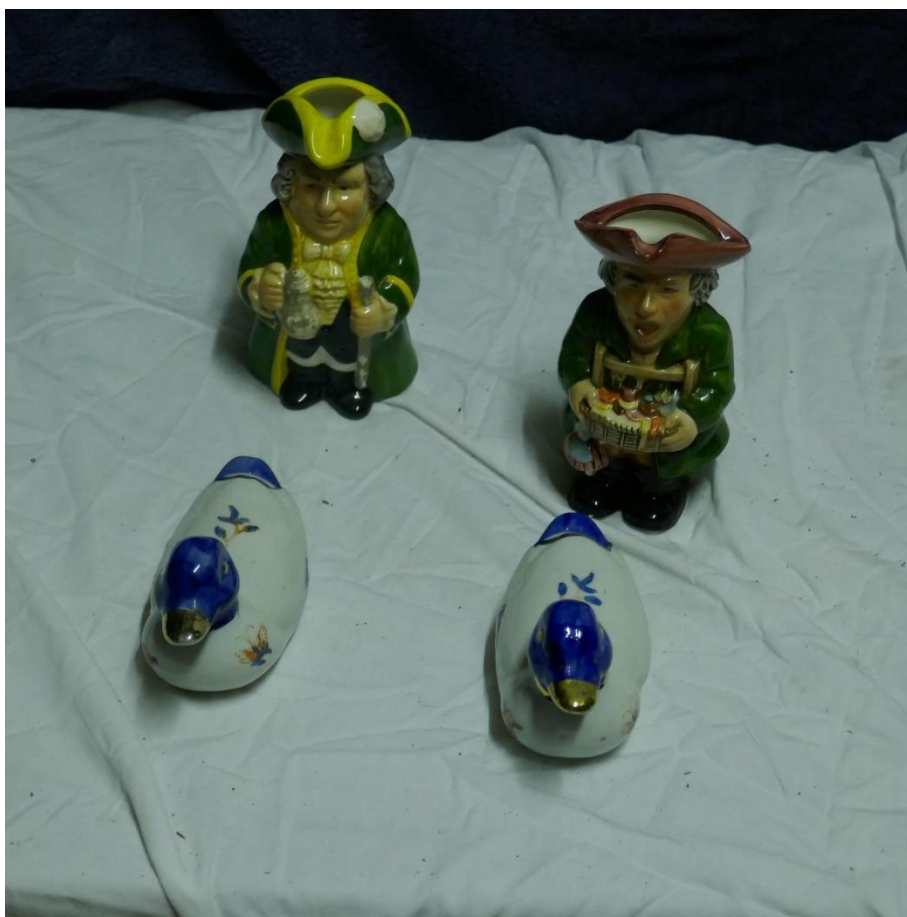
Lot 26 Two Toby Jugs to go with two ducks